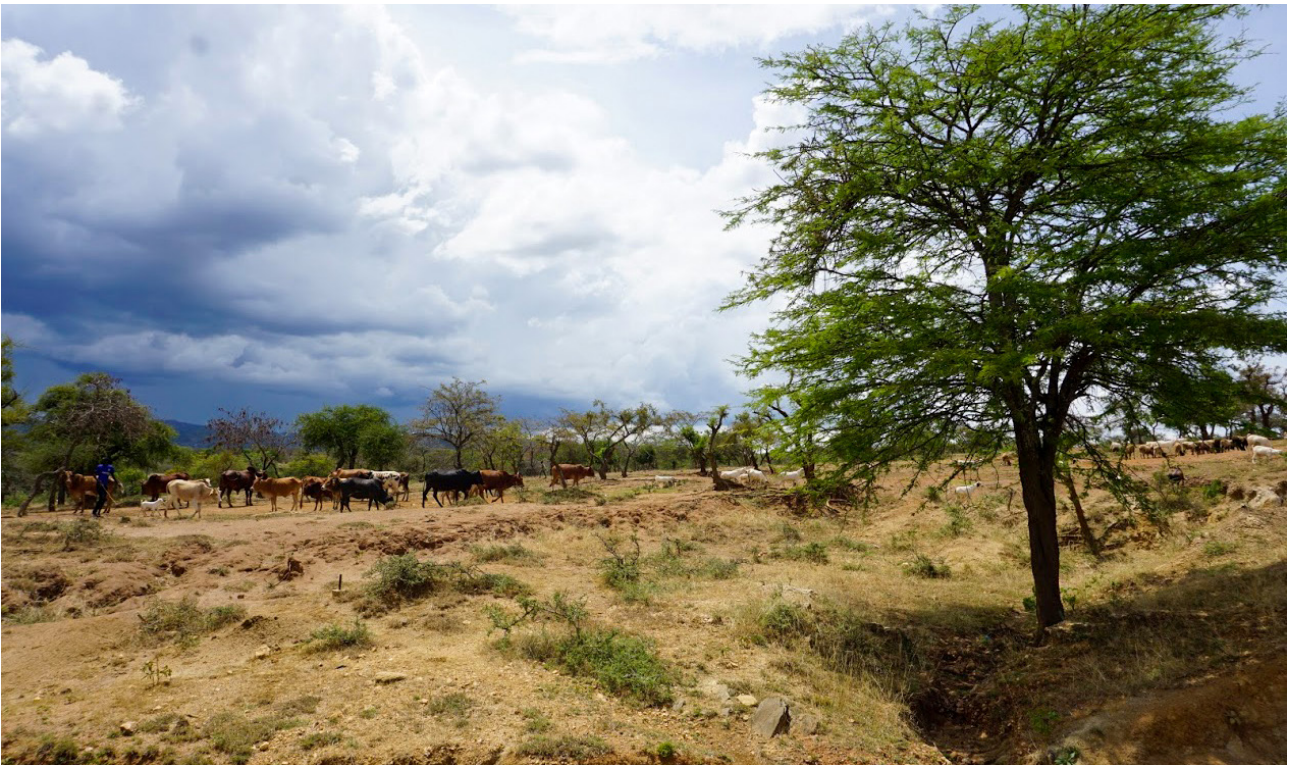
Livestock grazing in the rangelands of Chepareria, West Pokot, Kenya.

The net effect of trees on groundwater recharge in the Burkina Faso study depends on gains from improved soil hydraulic properties and losses to evapotranspiration; the balance varies with local conditions. Both the optimum tree cover and the magnitude of benefits that result depend on multiple factors, including soil, terrain, rainfall, land use and the nature of the vegetation, but it is clear that greater tree cover can improve recharge over vast regions, especially where land degradation has impaired infiltration (Ilstedt et al. 2016).